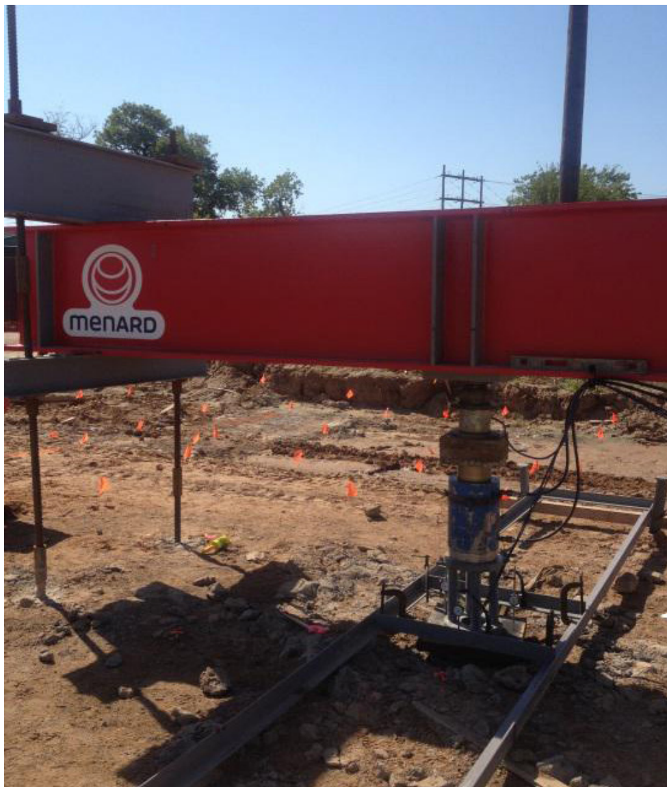
Fig 2: Example of single element load test on CMC rigid inclusion

In order to confirm the validity of the design of the CMC rigid inclusion system, Menard has the capability of performing several different types of load tests. The most commonly utilized load test most closely resembles the ASTM 1143D “quick load test”. This single element load test is effective for confirming the parameters used in the design of the CMC rigid inclusions are justified. In most cases, the load test will be set up by installing four reaction elements, followed by the test element. While Menard continues to install production elements, the load test CMC rigid inclusion is allowed to cure until sufficient grout strength has been achieved—typically seven days, although strength may be reached and the test performed sooner in some cases. Once the load test apparatus is set up and the test is run,