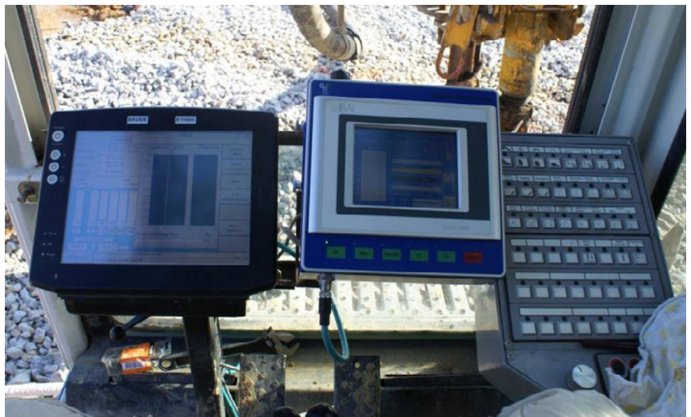
Fig 1: Onboard real-time monitoring system for CMC rigid inclusions

As the CMC rigid inclusions are being installed, a real-time monitoring system is utilized in the rig to track installation parameters constantly during the installation process. Parameters that are tracked include rotary and crowd pressure, depth, grout pump strokes and pressure, rotation speed, and torque. The monitored information is displayed in real time on a screen in the drill rig, so the