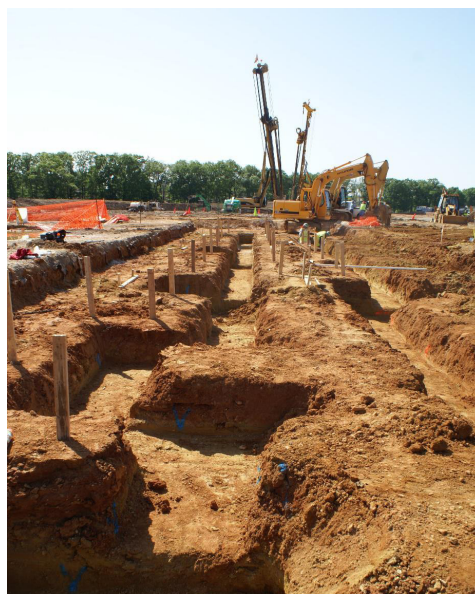
Fig 3: Excavation of Wall Spread Footings After Installation of CMC Rigid Inclusions

In the case of non-displacement drilled pile or drilled shaft foundations, the soil is excavated or mined to the surface in order to create a void into which concrete and reinforcing steel