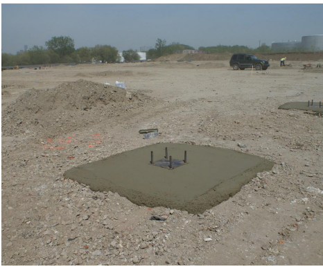
Fig 2: Example of Spread Footing Supported by CMC Rigid Inclusions

intended to directly support the loads imposed by a structure, but to improve the global response of the soil in order to control settlement and increase bearing capacity of the native soils.